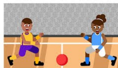
Dodgeball Start of Game