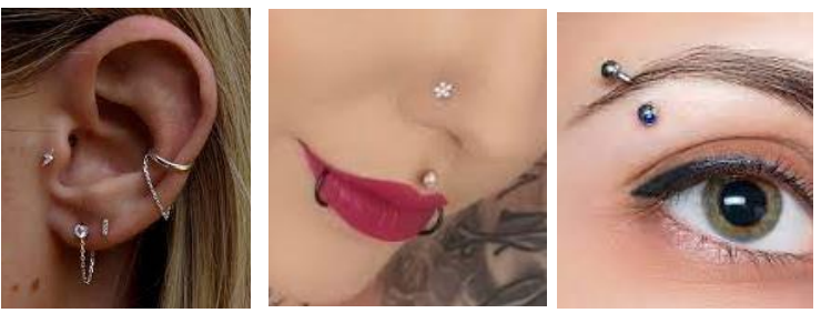
⊗ NO – other piercings of <u>any</u> kind