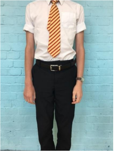
NO 😕 Long sleeves rolled up