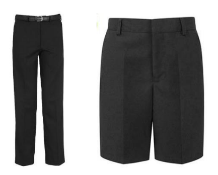
------ O YES ------KITZ Boys Trousers KITZ Boys Shorts (Shorts Optional for Summer Term ONLY)