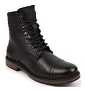
8 NO boots