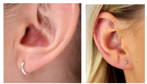
☺ YES – small sleeper/stud in the lobe