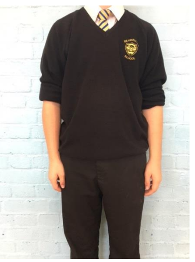
No 🙁 Sleeves rolled up