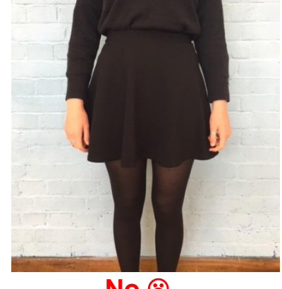
No 🙁 Jumper tucked into skirt (+ non-pleated skirt + too short)