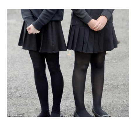
⊗ NO Too short